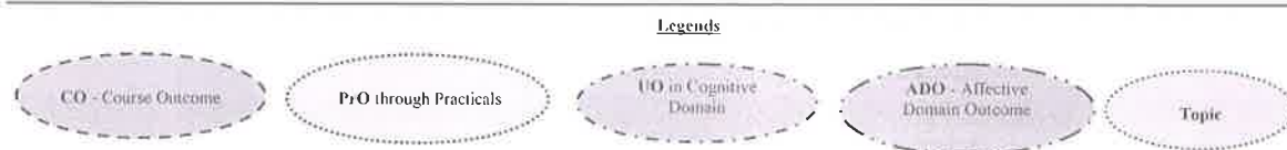
Figure 1 - Course Map